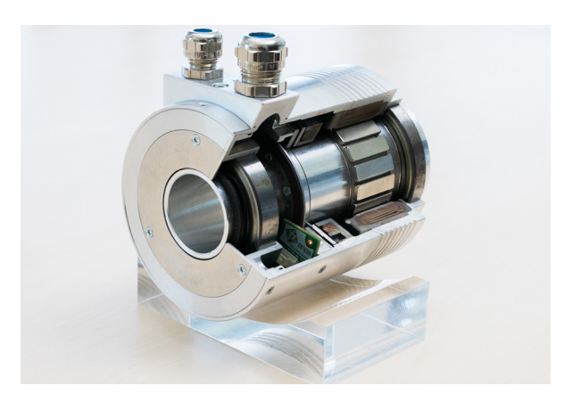
Cut-away of a TQ-RoboDrive hollow-shaft servomotor with an AksIM™ magnetic absolute encoder.

"The world of collaborative robotics in particular is still relatively small, but it is growing dynamically with every year. Within this community, I see the need for constant dialogue amongst suppliers and customers to ensure that we're all working to fuel the newest trends and solve the biggest challenges. It is very important to have a reliable encoder partner. The variety on the market is huge and we needed the best technology that would fit into our motors. One of the benefits of a partnership with RLS and Renishaw is that they are key players on the market with products that everybody knows. Trouble shooting is also much easier as TQ-RoboDrive can call on RLS and Renishaw for technical support if needed."