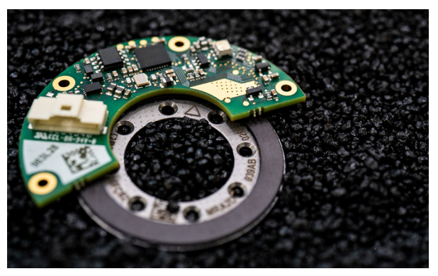
RLS AksIM™ magnetic absolute Off-axis (hollow shaft) encoder.

For its ultra-low weight frameless motors designed for robotics applications, TQ-RoboDrive sought a precision magnetic encoder solution. This demanded a new miniature absolute encoder that wasn't available on the market.