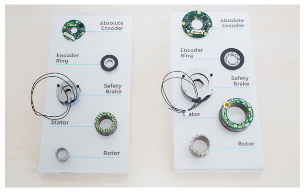
TQ-RoboDrive's frameless servo kit solutions on display.

Improvements in existing AksIM technology were implemented to meet the challenging requirements of the electric motor such as extended temperature range, higher immunity against stray magnetic fields and ease of set-up.