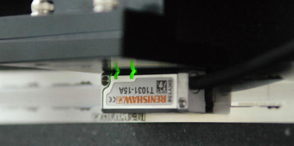
TONIC RELM encoder system