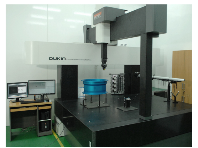
DUKIN uses REVO 5-axis probe systems on their CMMs.

Furthermore, DUKIN Co. have incorporated different optical and laser Renishaw encoder systems into their CMM series to meet varying challenges. Systems include: Renishaw's TONIC with RGS gold scale (not recommended for new designs, alternative upgrade: RKLC scale) which masters to the substrate, and RLE laser interferometer-based encoder.