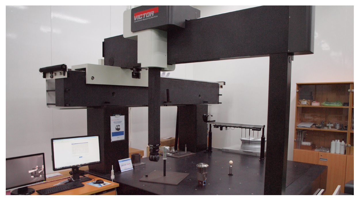
DUKIN's Victor series CMM system

We have adopted Renishaw's TONiC<sup>™</sup> encoder series and the ultra-high precision RLE interferometry laser encoder system. The high-performance TONiC encoder is the most widely used and has been integrated into our CHAMP, HERO and VICTOR CMMs. These models are designed for applications in the flat-panel display (FPD), micro-electronics, automotive and aerospace industries, as well as other markets.